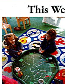
Building a wall for Humpty Dumpty...and trying not to fall!