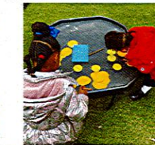
Practising reading and writing our different phonics sounds this week.