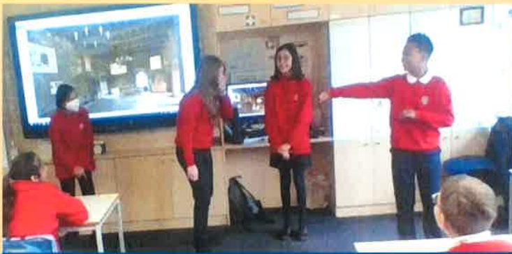
Role playing Banquo's ghost appearing at the banquet