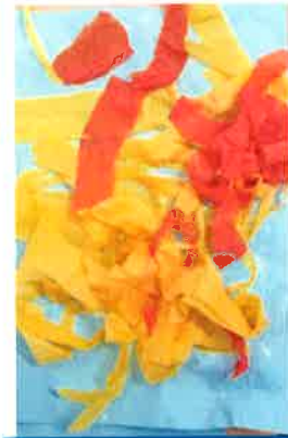
Abrar - Honeybees