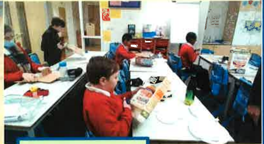
Junk model rovers

Eagles really enjoyed their day. We completed different activities and found out lot of interesting facts about the red planet. During our virtual visit to the planetarium we learned that the temperature on Mars is very cold and why it is called the red planet. Have a go yourself at this fact or fiction question.